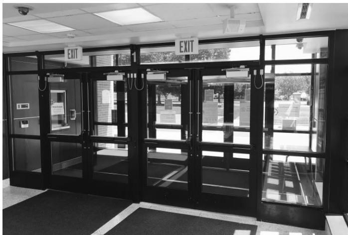
MRHS Security Vestibule