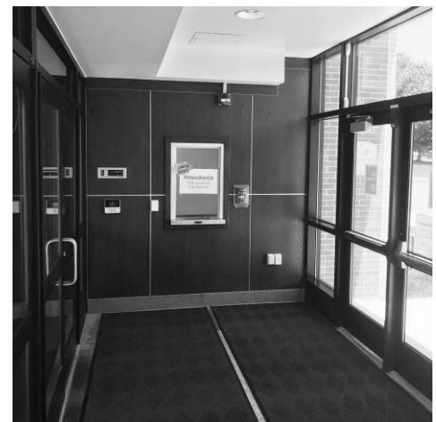
Attendance Office - Bank Teller Window